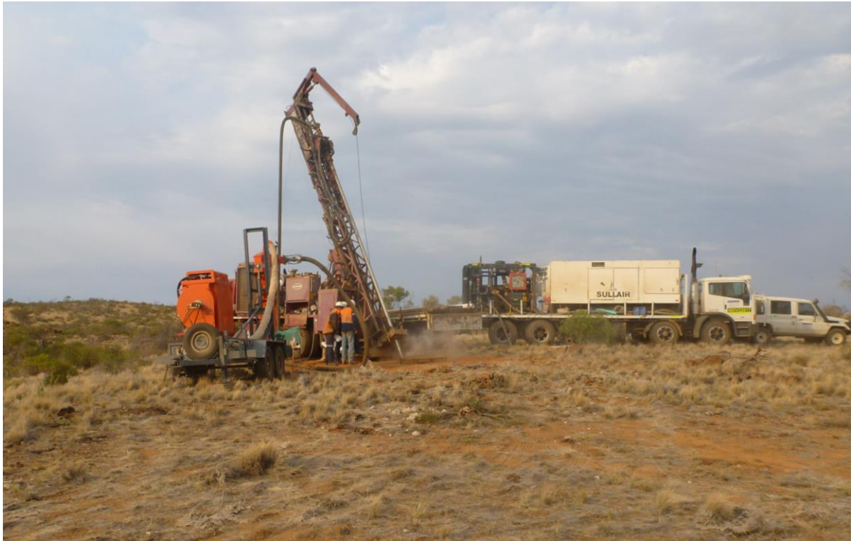
Figure 1. Core Exploration's RC drilling on the Scott Lee Prospect, Fitton Project, South Australia.