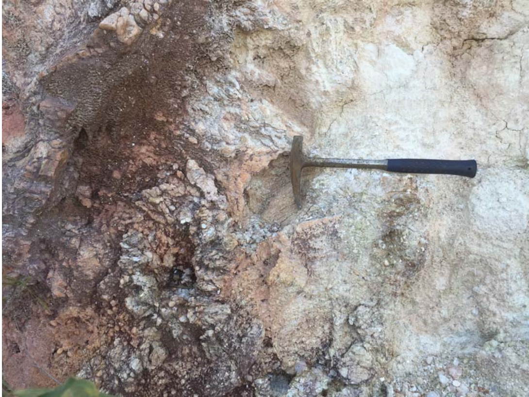
Figure 2. Weathered pegmatite in mine pit wall, Mt Finniss Mine, Finniss Lithium Project NT.

Core's project area covers over 200km 2 and 25 historic pegmatite mines (Table 1), including the Bynoe pegmatite field and the Mount Finniss Tin Tantalum Mine – the largest historically producing tin and tantalum pegmatite mine in NT (Figures 1-3).