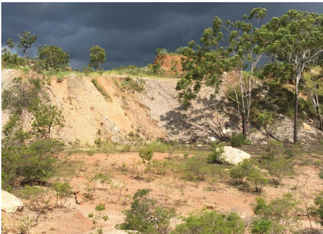
Figure 1. Eastern waste dumps, Mt Finniss Mine, Finniss Lithium Project, NT.

As with Greenbushes, before economic lithium was recognised, Bynoe also has a 100 year history of tin and tantalum production. It is also evident that the lithium bearing pegmatites in the Bynoe region are zoned with the economic tin and tantalum mineralisation and other strong lithium indicator elements including caesium, rubidium and beryllium.